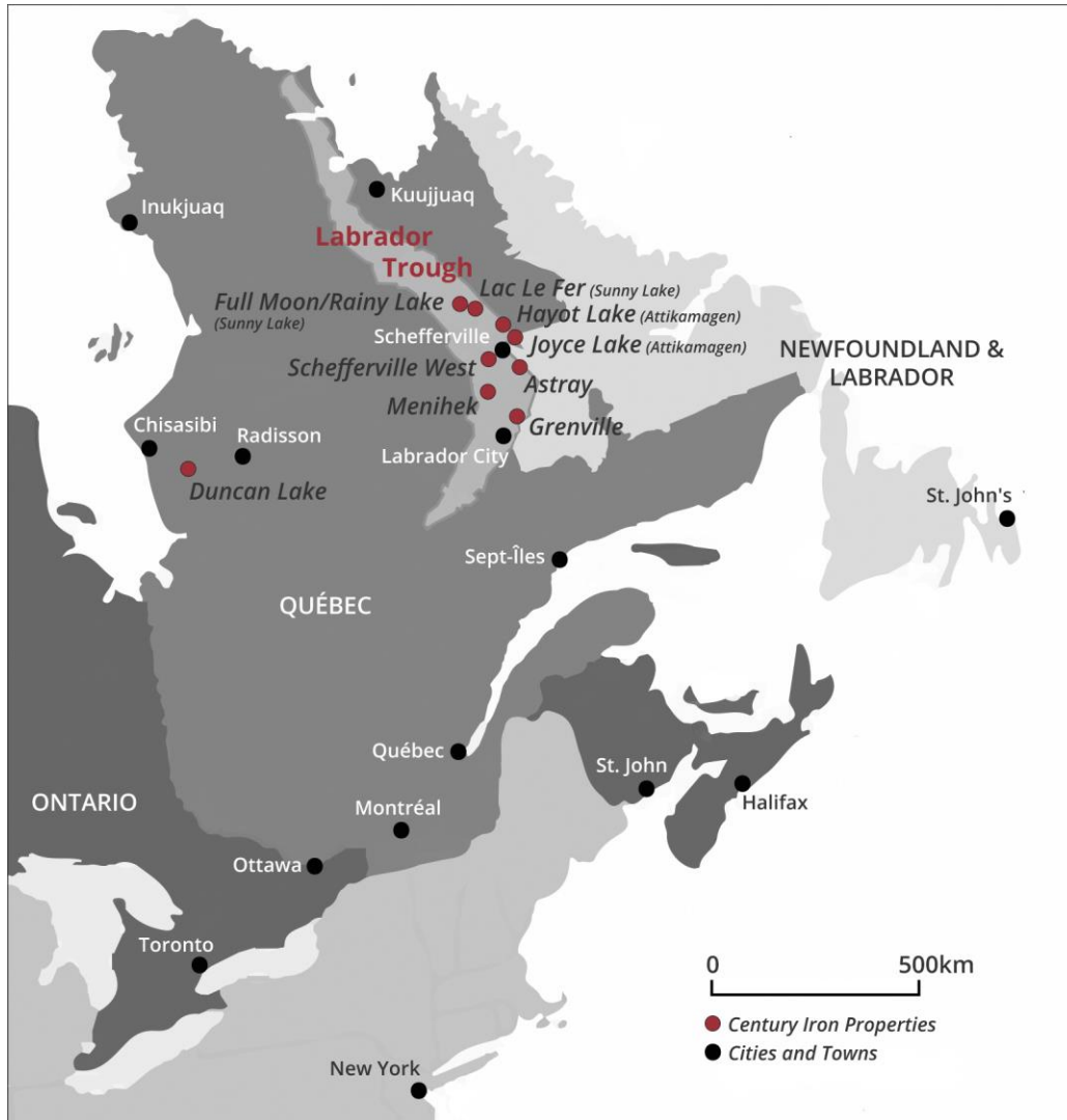
Fig. 1. Map of Century Iron's Properties

Century Iron is an iron exploration and development company based in Toronto, Canada. Century Iron has iron properties in the Labrador Trough, a region that spans northeastern Québec and western Labrador (in Newfoundland and Labrador), as well as in the James Bay region of northwestern Québec.